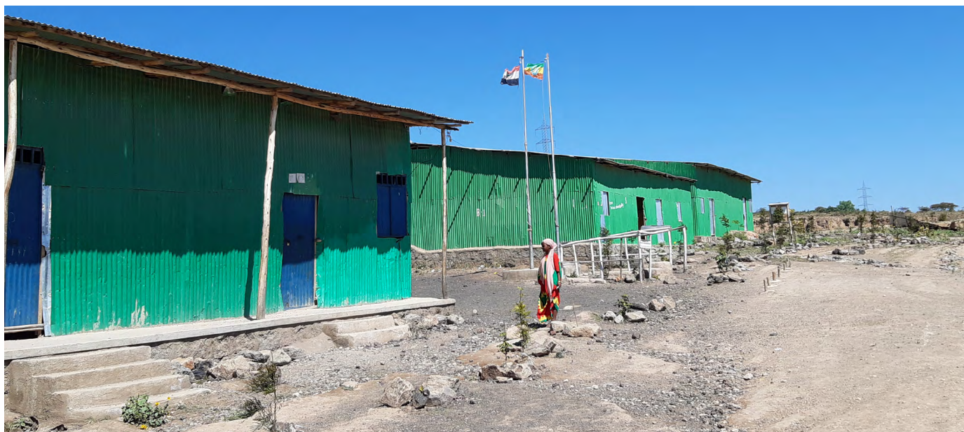
IDP schoolchild at Sena Seba school, Adama, Ethiopia.

donations, particularly those above a certain amount, by making them tax-deductible may increase some actors' willingness to donate. Finally, registering all forced migrants upon arrival in cities can facilitate the assistance that is offered to them by providing better knowledge of how many have returned and the demographics and needs of those who remain.