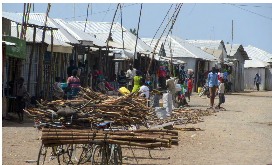
A street in Kakuma refugee camp, Turkana county.

people to move to the cities in search of urban-based opportunities, especially youth. Young people of Turkana County increasingly migrate to urban centres in search of changing livelihoods, access to education, and training.