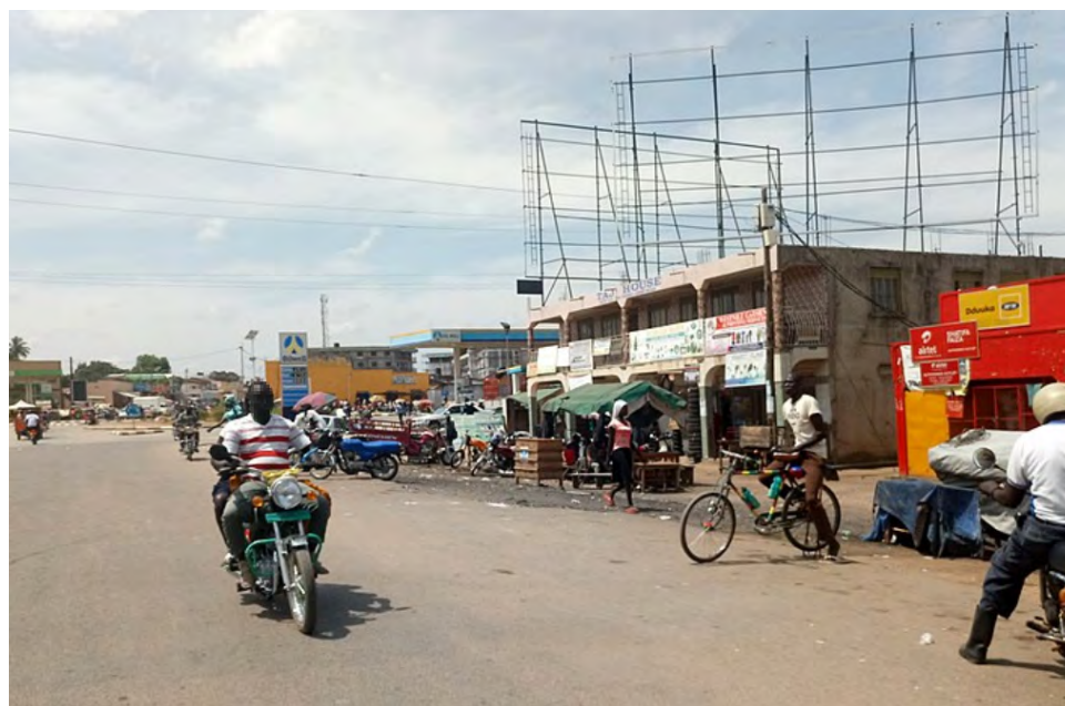
Street in Arua, Uganda.

Living in Arua is really so challenging in that rent is so expensive for me to afford a good house for my family. Landlord keep increasing rent charges which made me to move to where I am right now. The high prices in the market on food items have been hard, especially during the COVID-19 lockdown yet the food I receive from the settlement cannot sustain my family to the end of the month. 16