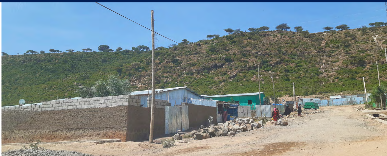
IDP settlement in Adama city, Ethiopia.