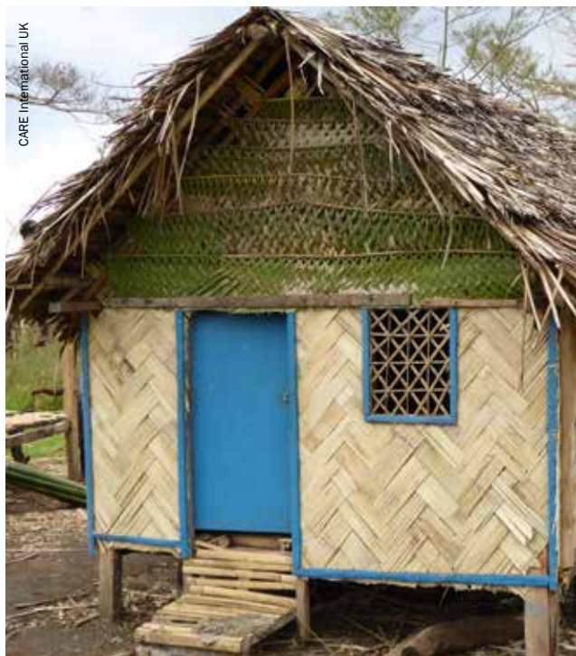
Self-recovery in Vanuatu.

The Philippines after Typhoon Haiyan highlights many of the advantages, and some of the pitfalls, of a self-recovery programme. First among the positives is the control, agency and choice exercised by the family. The most striking visual evidence of the sense of ownership stimulated by self-recovery is the delightfully designed woven bamboo screens and the bewildering array of potted plants that adorn the front of every house. A self-recovery approach