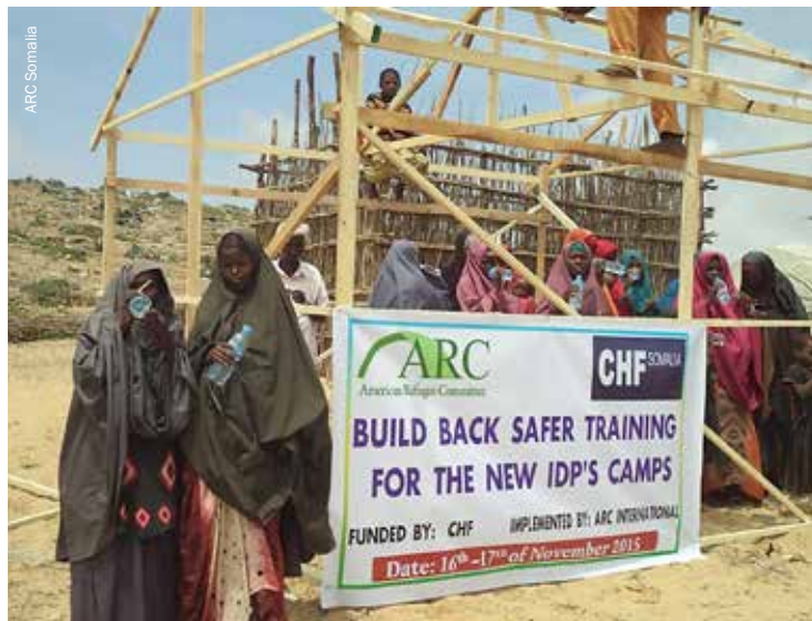
Somalia Humanitarian Fund shelter project, Somalia.

the rest opted for the larger corrugated iron sheet house, with adequate space and privacy being the main determining factors for their selection. It would be useful to do further research to better understand the choices that the beneficiaries made.