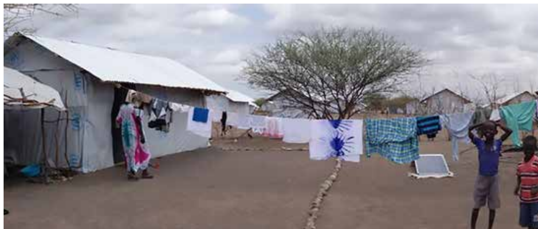
Recently arrived refugees, Kalobeyei New Settlement, Turkana, Kenya.

Under this agreement, 1,500 hectares of land were allocated in Kalobeyei, 15km to the west of Kakuma camp, for a new refugee settlement. UNHCR and its partners agreed to develop the site as an integrated settlement for 60,000 people – refugees and members of the host community – underpinned by social and physical infrastructure and a diversity of economic opportunities. Given its expertise in spatial planning, UN-Habitat was invited to partner in the settlement development process. The county government of Turkana would be fully involved in planning, construction, monitoring and evaluation of the settlement and would take over its management in the medium to long term, administering it as an urban settlement and providing basic services. The new settlement could then, over time, generate tax revenue to pay for services.