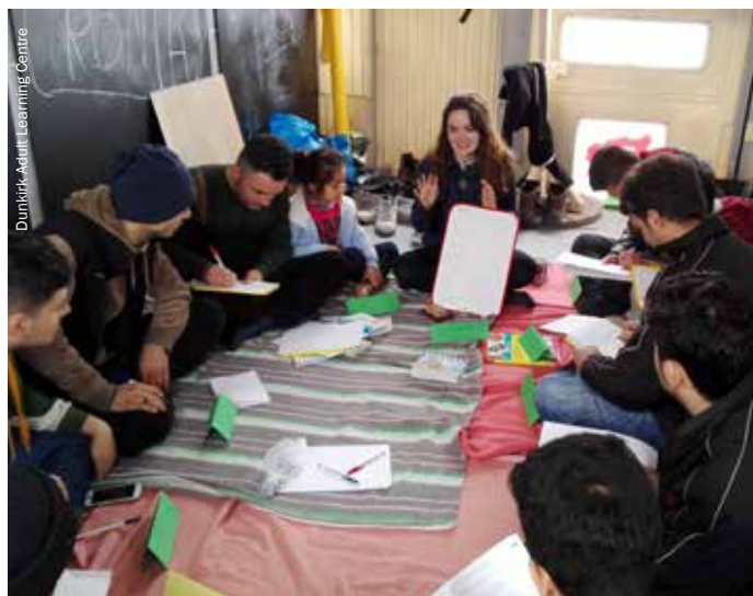
'Learning for unity and understanding' at Adult Learning Centre, Dunkirk.

The temporary structures that are generally used do not meet the multiple programmatic, cultural and environmental needs that exist in displacement situations and unfortunately the majority of settlements that are set up as temporary settlements end up becoming permanent. In the best case, the solution for these more permanent settlements is to replace the tents with metal containers which are costly, difficult to transport and install, and require additional equipment and facilities in order to provide a minimum quality of life. We found that there is no comprehensive solution for