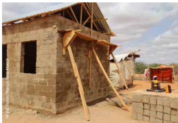
An IDP family with their new shelter in Dollow, Somalia. "I selected the cement-block house because the size is good for my family and it is cool inside."

In one programme run by an SSC member, prototypes of shelters of different types were constructed to similar budgets and the beneficiaries were given the information on the different aspects of each type. They were then allowed to choose a shelter type based on their needs and preferences. The three different prototypes were made of cement blocks, stabilised soil blocks and corrugated iron sheets. Less than 20% of the beneficiaries opted for the cement house;