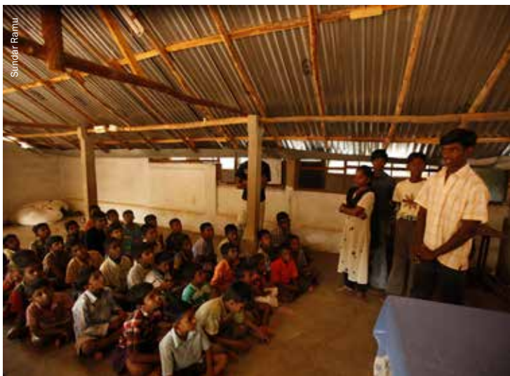
A student-led forum for school children in a Sri Lankan refugee camp in Tamil Nadu, India.

A variety of programmes were organised by OfERR to promote education among the Sri Lanka Tamils: nursery education, primary and secondary schooling, evening classes, higher education, computer training, and school and college student forums. Sri