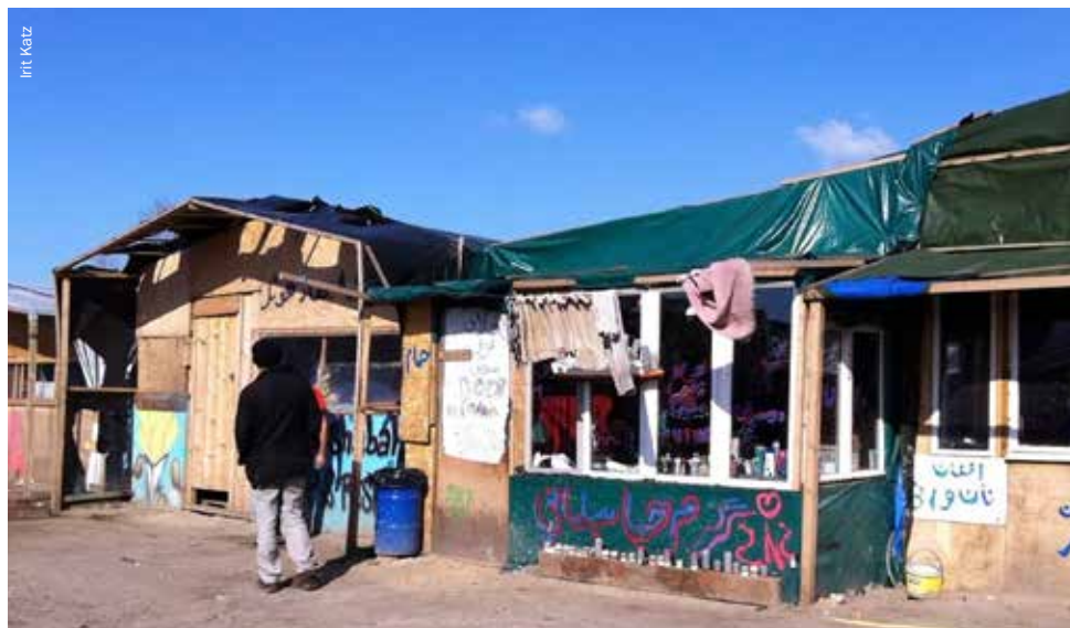
The 'high street' in the Calais Jungle, April 2016.

into the immigration regime. The decision to dismantle the Jungle and relocate its inhabitants to alternative accommodation in shipping containers and reception centres across France was primarily a political act, not a humanitarian one.