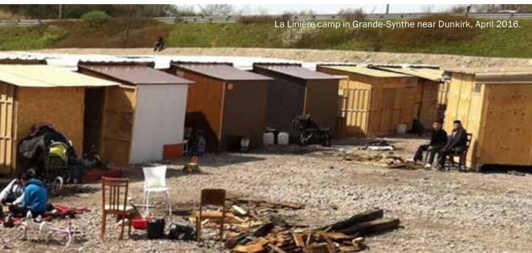
La Linière camp in Grande-Synthe near Dunkirk, April 2016.

According to researcher Michel Agier, a 'camp' has three main characteristics: extraterritoriality – the camp is not part of the surrounding area; exception – the camp is not subject to the same laws as the state in which it is located; and exclusion – the camp is a marker of the difference between its inhabitants and inhabitants or visitors from outside. 2 These conditions were only to some degree fulfilled in Grande-Synthe.