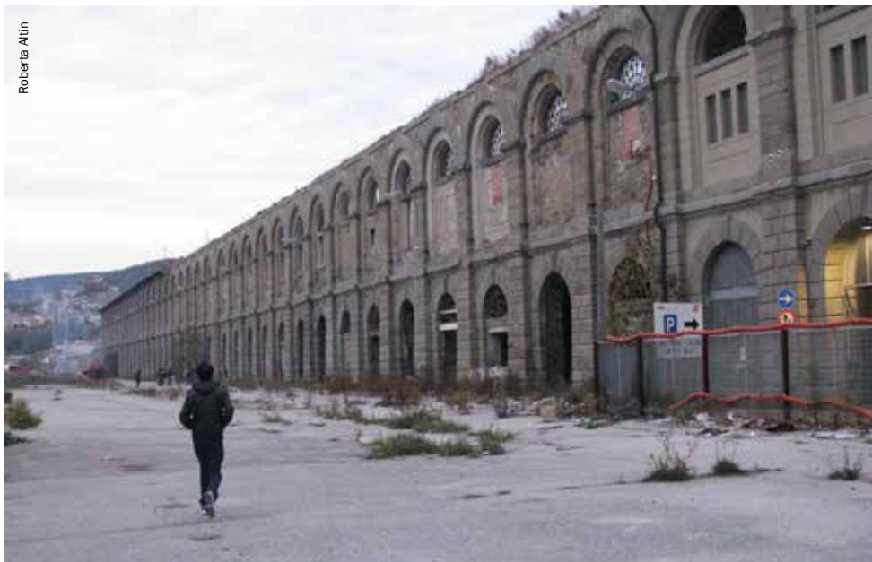
Silos, in Trieste, Italy.

information centre for newly arrived asylum seekers, and a daytime social centre also for refugees hosted in the SPRAR system who still suffer from the loneliness peculiar to and shared by migrants. Silos is at once a central place and one of transit, close to public transport and the port and just a short walk from the soup kitchen, the hospital and the social services of various NGOs. It works as a sort of informal hub – situated in the heart of the city but not overly visible.