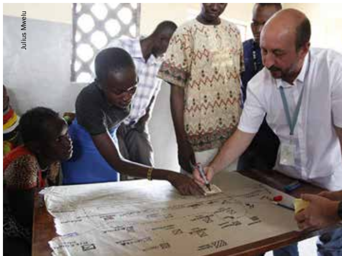
UN-Habitat planner mapping out wants and needs for Kalobeyei with local host community settlement development group.

stakeholders with an interest in the new settlement's development. For example, the Turkana County government and UNHCR co-lead together with UN-Habitat the thematic group on spatial planning and infrastructure development. This structure of engagement has on the whole been effective in building the confidence of the communities in the authenticity of the process. The involvement of the county government of Turkana, which initiated the idea of integration, has been crucial to enhancing compliance of the resultant spatial plan with existing laws and regulations. Once the spatial plan is approved, the county government will have direct responsibility for monitoring its implementation.