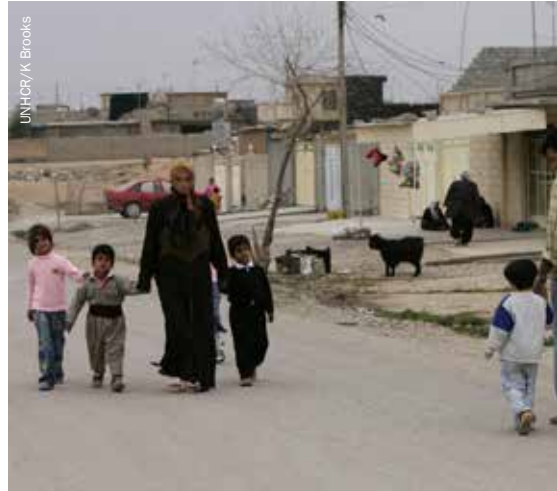
An internally displaced Arab Iraqi family in the north of the country walks through the Kurdish neighbourhood where they now live.

Outside conflict situations, CTP is often implemented as one component of more complex programmes. CTP on its own can, even under challenging circumstances, rapidly bring temporary relief to households and individuals, where volatile security conditions and short timeframes for implementation may initially complicate complementary measures. At a later stage of a protracted crisis, however, cash transfers should be linked to additional support measures – such as acquiring qualifications and accessing training, or enabling access to financial services such as small business grants or savings products – in order to achieve lasting effects that go beyond initial stabilisation. Such measures may be challenging but are particularly relevant in northern Iraq, since a succession of crises has seriously limited the absorptive capacities of the local labour market,