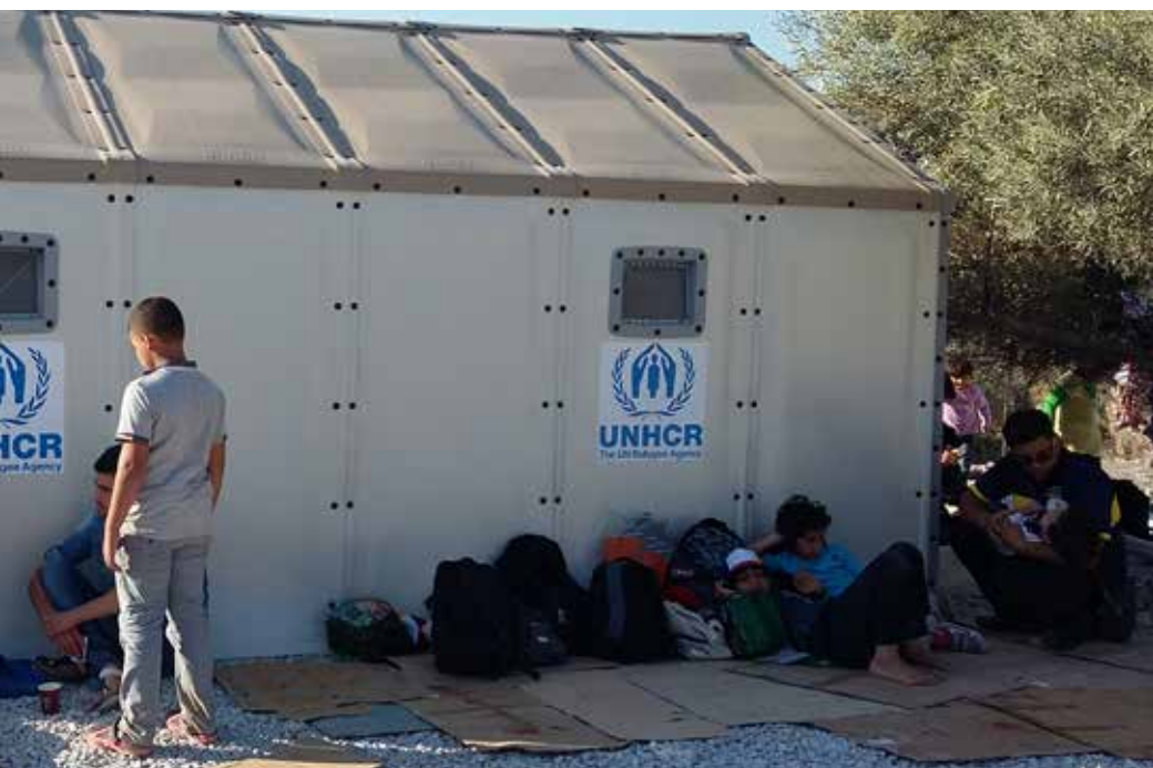
Refugee Housing Unit, Kare Tepe, Lesbos, Greece.