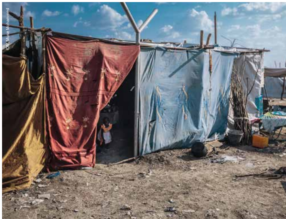
A makeshift shelter in the Malakal Protection of Civilians site, South Sudan.

First, given the spatial and temporal nature of conflicts, shelter specialists and other humanitarian actors are forced to merge rights-based approaches with material needs-based approaches and, in