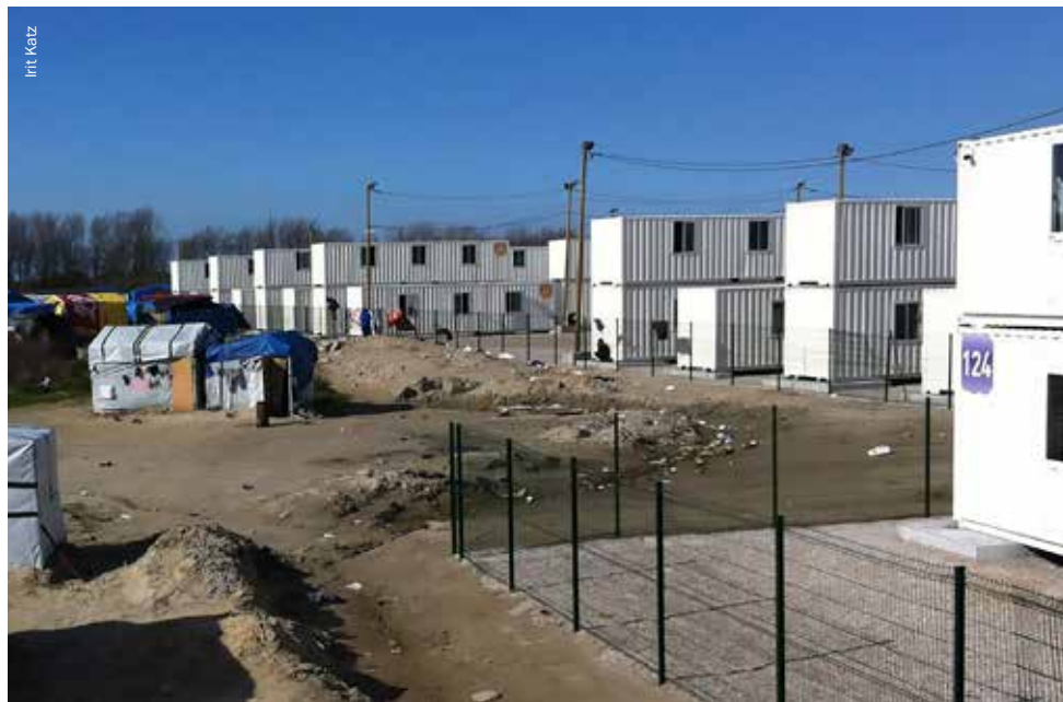
The container camp and part of the Calais Jungle, April 2016.

While these pre-fab shelters are sometimes 'state of the art' building technology, they are designed to answer general needs in no particular location and for no particular people. The materials used are often suitable to some climates better than to others; their methods of construction often resist alteration and appropriation by their users and cannot be easily adjusted to particular human needs and habits; and their deployment on site in large numbers, often in a grid which is easy to create, control and manage, usually produces repetitive and low-quality spaces which serve a particular purpose but are alienating to their inhabitants. The idea that these pre-fab shelters could be folded back into their original kits and be reused as the perfect sustainable solution for displacement is also erroneous; they are damaged quite quickly when they are lived in and cannot