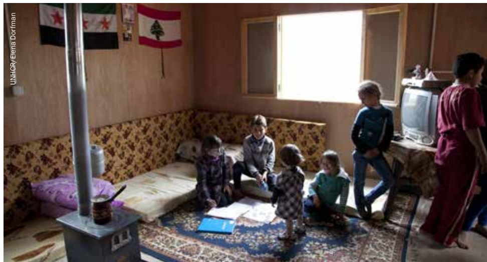
Syrian refugee children who are being hosted by a Lebanese family do their homework and play together.

for a duration of one to three years. Other guidelines suggest a four-party agreement between host, hosted, implementing agency and local authority. Yet no independent research has been conducted that shows the extent to which an agreed-upon end date reduces anxiety, and its influence on the quality or experience of hosting.