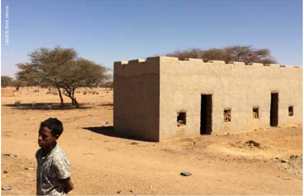
An example of vernacular architecture – local mud-brick buildings – that would be used as a prototype for upgrading M'Bera camp.

As the longer-term needs of M'Bera become clearer, the potential for spatial rearrangement is critical; the increasing formalisation of the settlement will inevitably require some movement of shelters, roads and infrastructure, and re-thinking of the relationship of some critical elements. In this sense, the current shelter design and the overall settlement have the capacity to undergo a rearrangement more suitable to longer-term needs. This material and spatial flexibility also requires a strategic shift from a humanitarian approach to a phased developmental approach. The refugees have indicated that even if a reasonable degree of peace and stability could be achieved in Mali in the near future, a number of them would not return but would remain in M'Bera. In any case, the consensus is that the security situation in Mali will remain unchanged in the medium term and refugees have a realistic understanding that they will remain in M'Bera for several years to come.