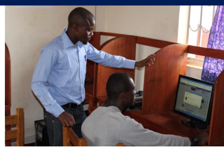
Photo: YARID Director and a member at their hub in Kampala.

5) Build a humanitarian funding mechanism to support bottom-up innovation. There is a lack of humanitarian funding available to support initiatives by affected communities. Funding that is channelled to 'local' partners tends to go through NGOs that may have little representative relationship to crisis-affected communities. Funding requirements and accounting and auditing standards need to be adjusted to enable affected communities to access seed funding.