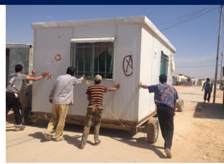
Photo: Syrian 'removal men' moving a caravan, Za'atari refugee camp.

We have found that bottom-up innovation is more commonly supported by opportunities in the local market or by other refugees, than by the international community.