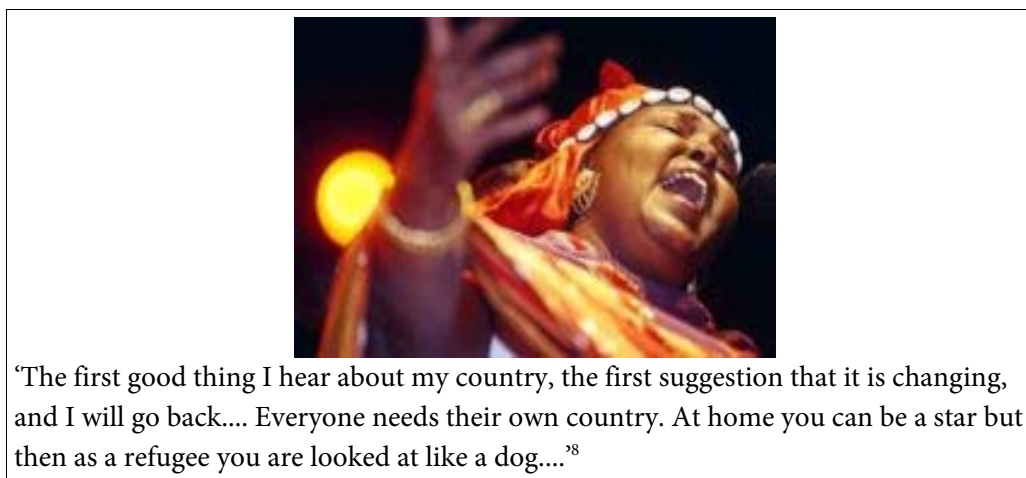
Figure 4: The Refugee as Talented.