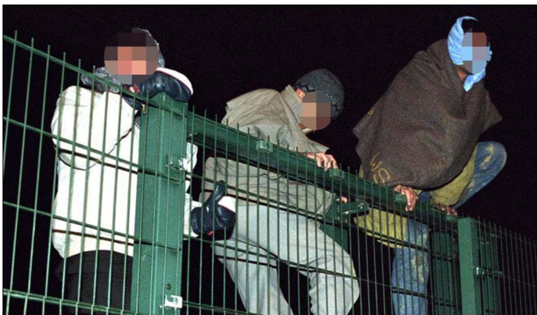
Figure 1: Image accompanying 'Asylum 6 sue UK for £300k', the Sun , 3rd November 2008.