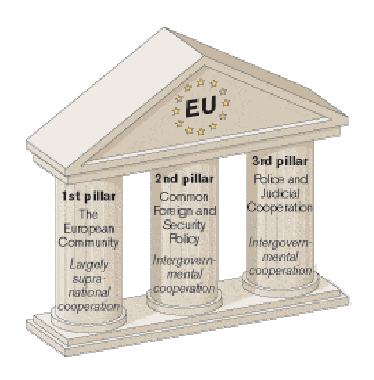
Fig. 1 European Union Pillar Structure

Following the 1992 Maastricht Treaty on European Union (CEU 1993), Community matters were divided into three pillars (see figure 1). Asylum and immigration were brought into the remit of EU competence, but within a defensive and securitised policy frame in the third pillar on 'Police and Judicial Co-operation'. Addressing the root causes of forced migration as a policy objective came into existence as a response to the perceived threat of potential migration from Central and Eastern Europe and to add further impetus into developing the EU Common Foreign and Security Policy (CFSP) in the second pillar. The situation in former Yugoslavia added a sense of urgency to this venture by the time the 1992 Edinburgh Summit's 'Declaration on Principles Governing External Aspects of Migration Policy' stated that it was "conscious of the role which effective use of aid can have in reducing longer term migratory pressures through the encouragement of sustainable social and economic development" (CEU 1992:2).