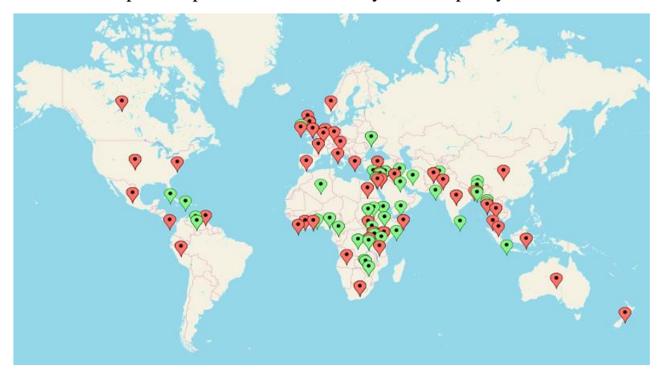
Who is taking RSC Pathways?

Green pin: Students' country of origin. Red pin: Students' current place of residence.