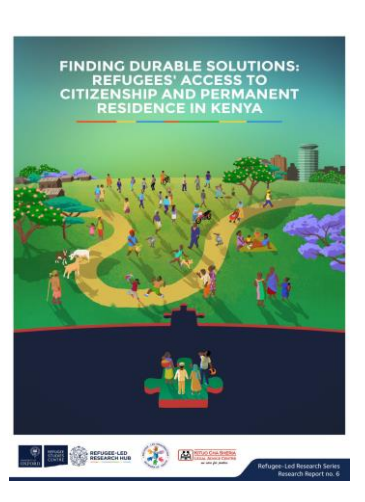
All RLRH publications can be accessed at refugeeledresearch.org