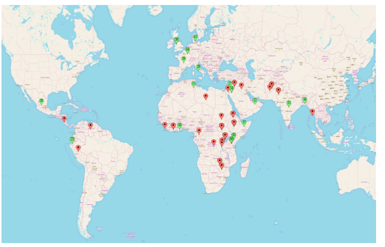
Who is taking the Online Course? Green pins: Students' current residence; Red pins: Country of origin