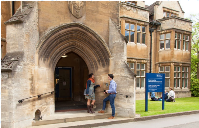
Oxford Department of International Development