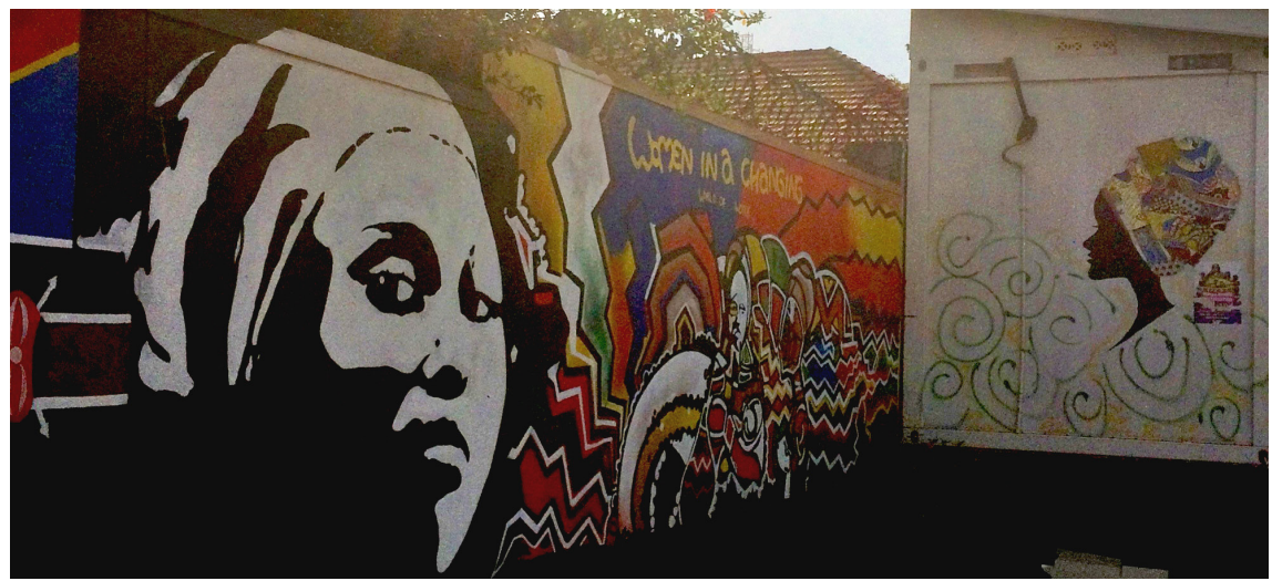
Photo: Mural painted by RCO 'URISE' at the Antonio Guterres Centre for Urban Refugees, Kabusu, Kampala.

Everyone stands to benefit from a world in which refugeeled organisations are able to effectively and efficiently serve the needs of their own communities.