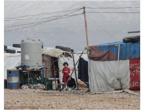
Syrian refugees near Zahle, Lebanon

To take an example in Jordan, in the governorate of Mafraq a series of opportunities to integrate Syrian refugees into local labour