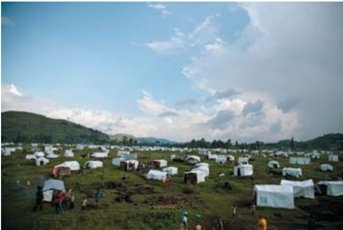
Refugees from DRC in Uganda