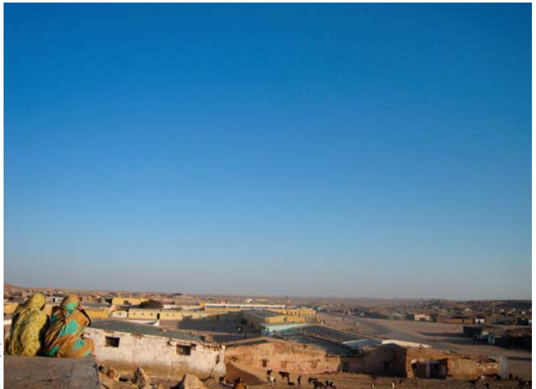
Two Sahrawi women look across the 27 February National Women's School and Refugee Camp (2007)

Design by www.advocate.uk.com Printed on 50% recycled paper