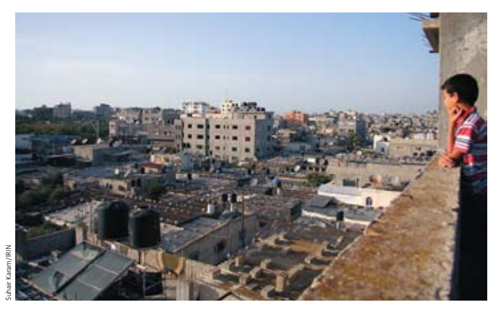
A boy looks out over Jabalia refugee camp, Gaza