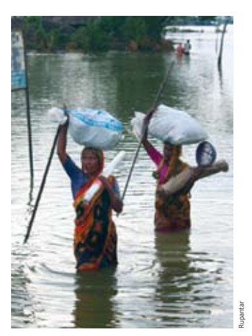
Cyclone Aila, Bangladesh

Full details at www.fmreview.org/DRCongo and on the RSC website.