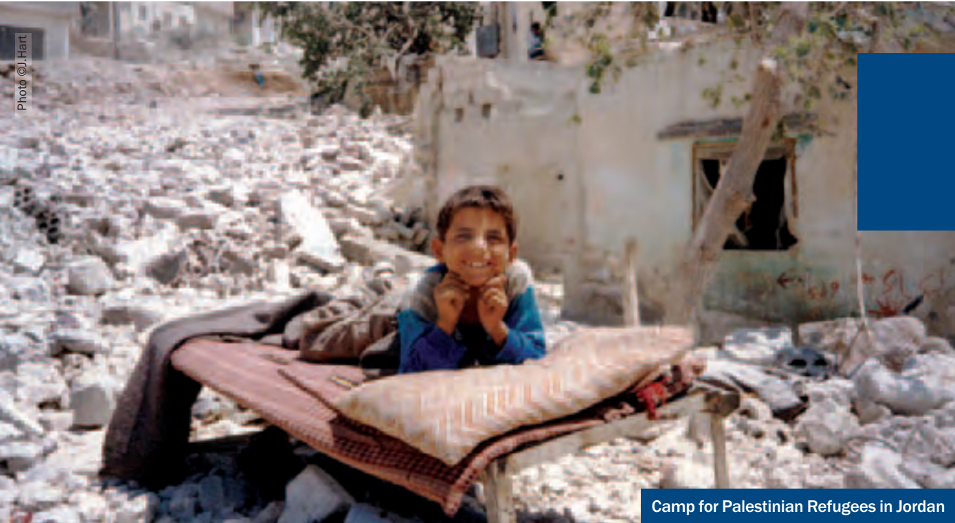
Camp for Palestinian Refugees in Jordan