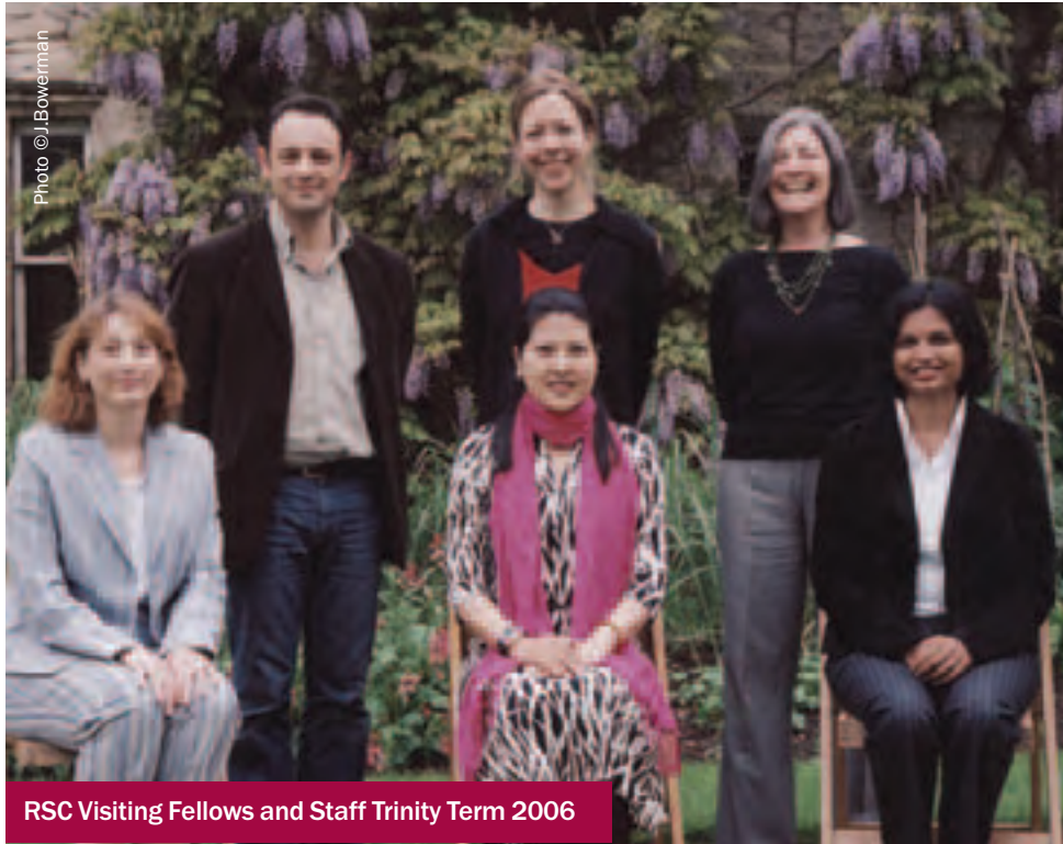
RSC Visiting Fellows and Staff Trinity Term 2006