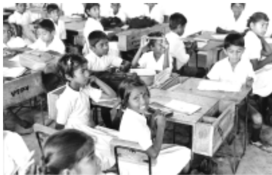
Sri Lanka/Internally Displaced Persons

One project of the RSC which aims to improve the collection of empirical data addresses the psychosocial adjustment of child soldiers in Sierra Leone and northern Uganda. Two widely-used psychological scales assessing adjustment have been adapted to the cultural contexts of both countries. This project aims to ensure that such psychological tools ultimately enable researchers to discern the adjustment levels of different groups of children, thereby providing a means of assessing the successes of different programmes aimed at rehabilitating children involved in conflict.