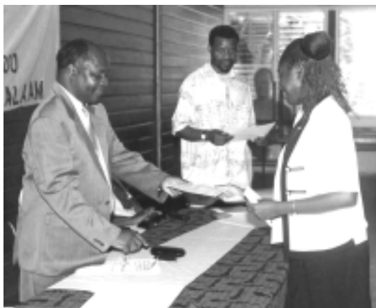
Presentation of an EASRHA Certificate of Attendance

With the help and support of the RSC, CSFM has been able to establish itself as a formal institution within the Faculty of Law at the University of Dar es Salaam and has succeeded in initiating courses relating to refugees and forced migrants within the University. The East African School on Refugee and Humanitarian Affairs (EASRHA) was inaugurated in January