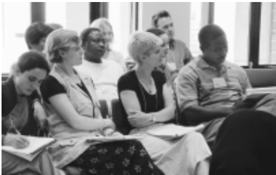
Summer School participants

"I was impressed with the diversity of issues being addressed and their significance to the general topic of forced migration. Each module