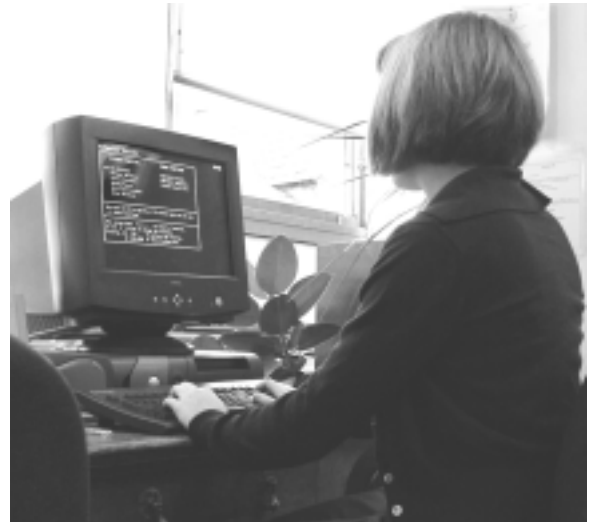
MSt student making use of the new computers

The benefits of integration have been very apparent in the first year. Recognition of the University's future commitment to the Library, taking full financial responsibility in 2003 once the transition funding from the Ford and Mellon Foundations ends, has been shown in the decisions to make the Librarian's position permanent, and to provide two-year contracts for her assistants. The Library has also recently joined the University's common photocopy card system. This allows photocopying in participating Oxford libraries with a universal copy card, which has greatly simplified copying procedures for readers. The Library has also been successful in upgrading a large proportion of its computer hardware through a bid to the centralised OULS equipment fund. The new computers have been greatly welcomed by both staff and students.