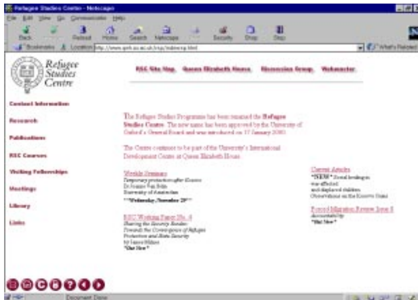
Screen Capture of the RSC's Web page

The RSC Webmaster is Corinne Owen, who can be contacted at corinne.owen@qeh.ox.ac.uk